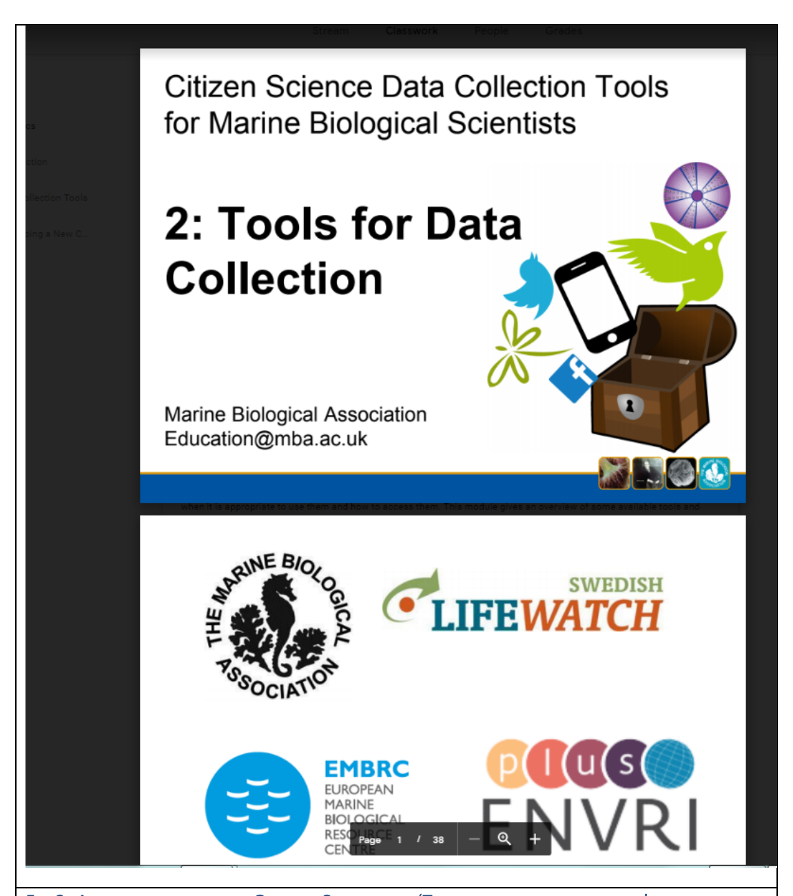
FIG 2: A SCREEN SHOT OF THE GOOGLE CLASSROOM 'TOOLS FOR DATA COLLECTION' PRESENTATION RESOURCE PROVIDED.