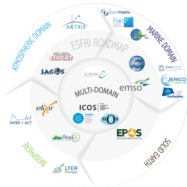
FIGURE 1 ENVIRONMENTAL RESEARCH INFRASTRUCTURE COMMUNITY IN MAY 2015