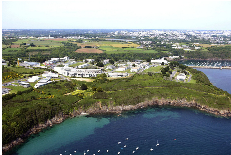
1625 Route de Sainte-Anne, 29280 Plouzané

From the airport: the best is to take a taxi - Taxi Brestois: +33 298 801 801