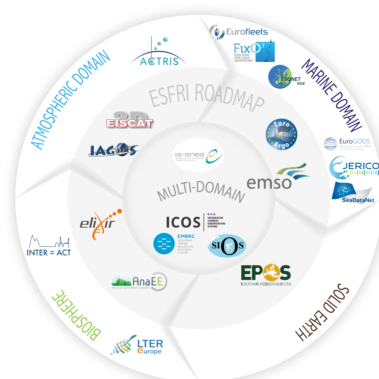
Figure 1: This figure illustrates the RIs directly participating in ENVRIplus. They represent different domains of the Earth System, with some of them having multi-domain approach. The inner grey circle shows RIs in the ESFRI 2010 Roadmap.