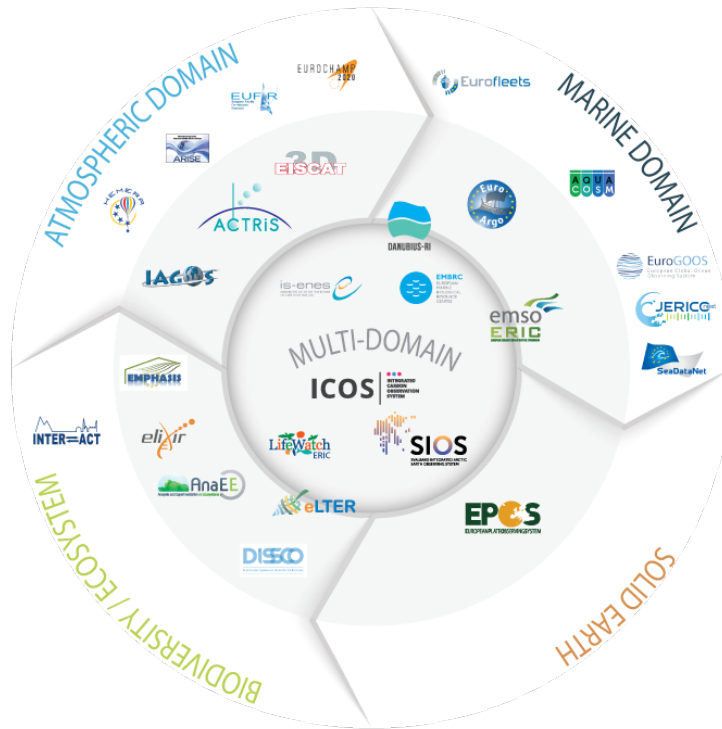
Figure 2: RIs and projects participating in ENVRIplus (those projects not having an ESRFI Roadmap status are located outside the grey circle).